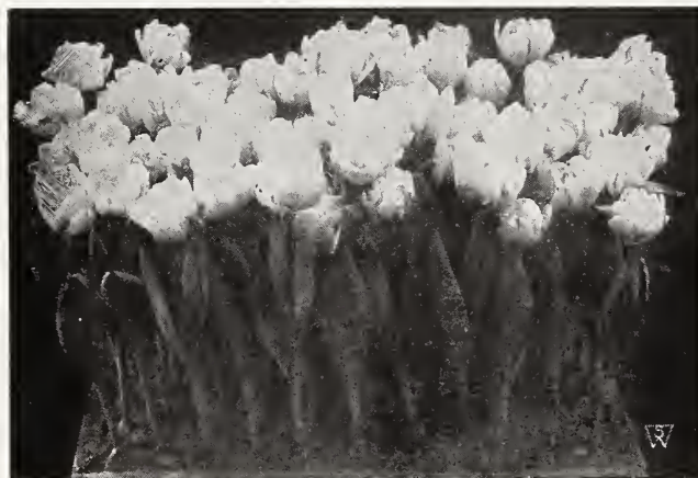
Double Tulip, Murillo

S. & W. Co.'s Special Mixture. A mixture consisting of 15 named varieties, blended so as to give an assortment of all possible colors and shades, all of vigorous habit and large size, uniform height and time of blooming. 60 cts. per doz., $4 per 100, $38 per 1,000.